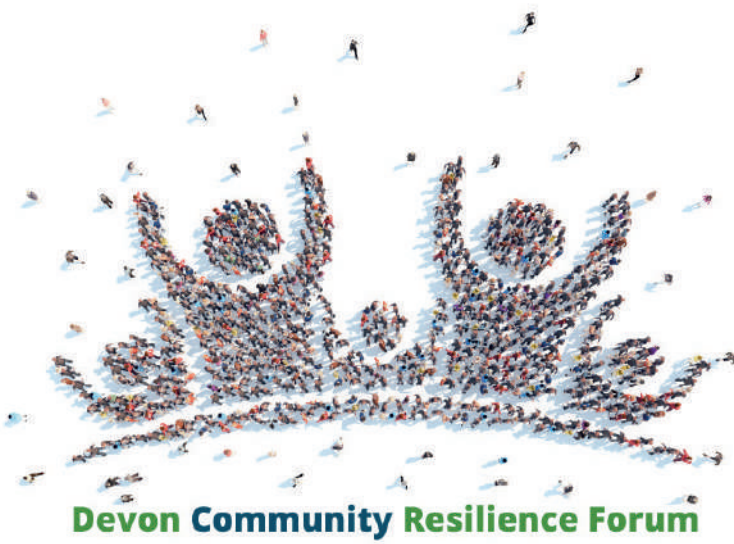
Devon Community Resilience Forum