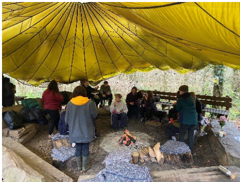
Mental Health Day on Dartmoor for people in recovery from alcohol and drug addiction

One of our clients was in the process of leaving a job acrimoniously having had issues with his management and was feeling very stressed and depressed. We got him involved in some physical building work we were doing and used that time to chat with him about his wellbeing and how he would see a group supporting him. During this time, he not only helped us to plan our group, but started a small group with his friends that he called the “Viking Institute”