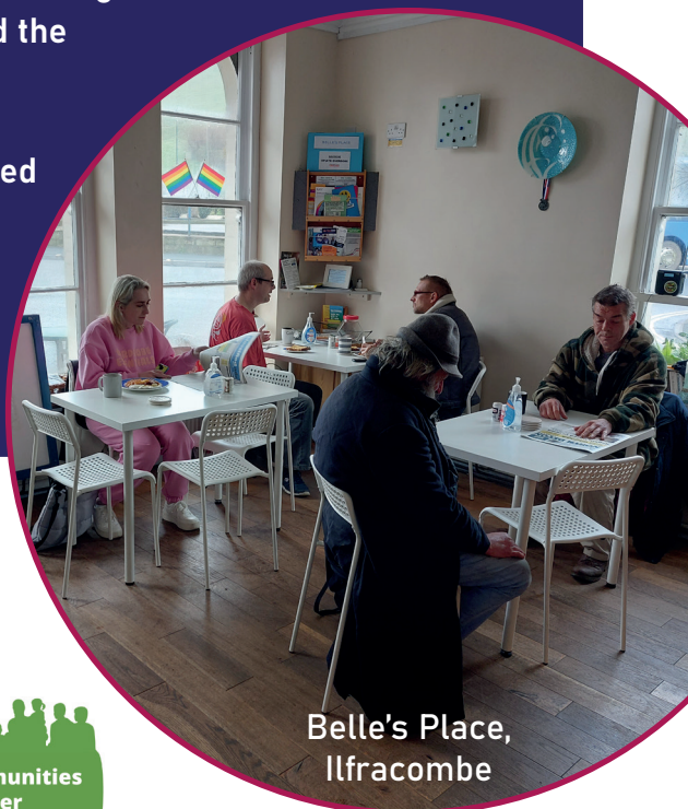
Belle's Place, Ilfracombe