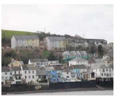
The mount, Appledore